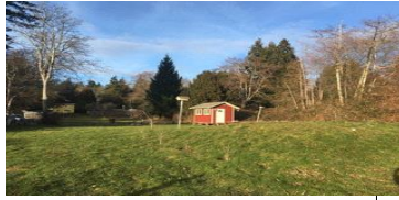
1926 LUMMI WAY