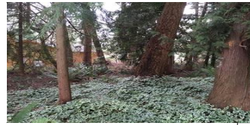
339 MILL RD

Property Taxes $319.84 Agency: prr Soils Not Done DEER PARK DIV #4 BLK: 4 LOT: 3