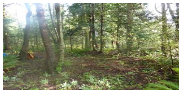
CEDAR POINT AV

Property Taxes $242.22 Agency: nrs soils work CEDAR HEIGHTS ADD #1 LOT: 23