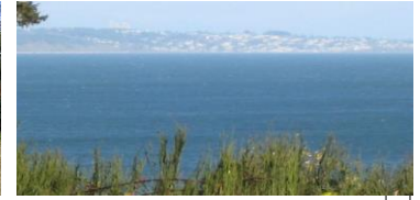
2122 WHALEN DR

Property Tax $806.85 Agency rm Septic Installed 3br DEER PARK DIV #3 LOT: 6, 7, 8