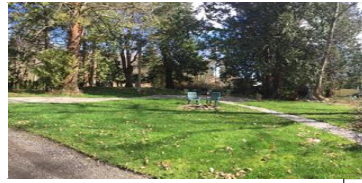
A P A RD