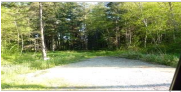
1854 Benson Road