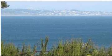
2122 WHALEN DR