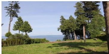
2281 BERRY LN

GOVT LOT 9-EXC W 417 FT THEREOF-LESS RE EXC PTN TO CO FOR RD DESC AF 1528302