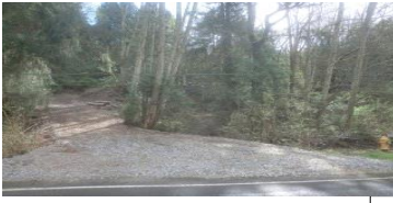
1835 ROOSEVELT RD