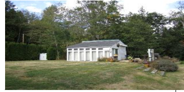
500 MOOSE TRAIL

Property Tax $713.85 Agency op Point Roberts Marina Estates Add#1 Lot:2