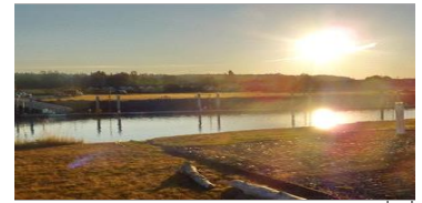
HARBOR SEAL D

TR IN GOVT LOTS 4-5 DAF-BEG AT INTER OF V LI SD SEC-S LI SUNRISE TERRACE PLAT DIV 2