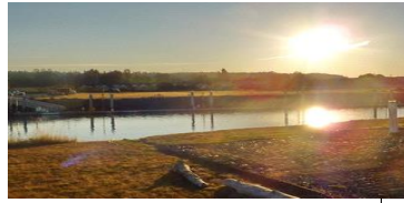
HARBOR SEAL D

TR IN GOVT LOTS 4-5 DAF-BEG AT INTER OF LI SD SEC-S LI SUNRISE TERRACE PLAT DIV :