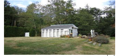
500 MOOSE TRAIL

E 1 ACRE OF N 149 FT OF GOVT LOT 2 TOGETHER WITH 405304-561411