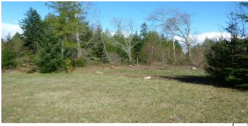
1885 PROVINCE RD