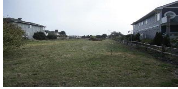
HARBOR SEAL D

Property Tax $483.04 Agency nrs PERMIT LARGAUD'S ISLAND VISTA LOT: 50- UNDIV 1/250 INT IN BEACH RESERVE