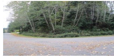
CEDAR PARK DR