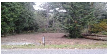
2122 CULP COURT RD

DELTA VIEW #5 LOT: 57-EXC UNDIV 1/2 INT IN GAS-OIL-MINRTS AS RES