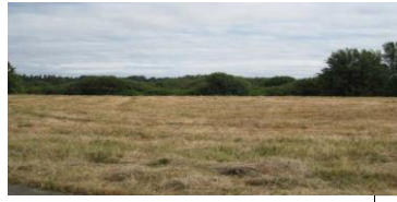
OCEAN VIEW LN

Property Tax $330.01 Agency rm 2BR Permit DELTA VIEW NO 5 LOTS 15-16-EXC UNDIV 1/2 INT IN GAS-OIL-MIN RTS AS RES PRIOR TO