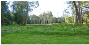
1841 Austin Road

Lot A Seldine Short Plat as Recorded AF 2140029