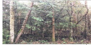
CULP COURT RD

CULP COURT DIV #2 LOT: 16-EXC ALL OIL-GAS-MIN RTS RES AF 969960