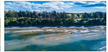
293 MARINE DR

Property Tax $3,358.16 Agency op POINT ROBERTS MARINA ESTATES LOT 7