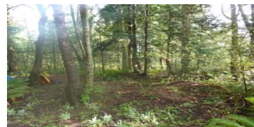
CEDAR POINT AV

$25,000.00 81x136 Property Taxes $328.47 Agency: nrs SUNSET HILL LOT: 5