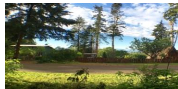
1959 PROVINCE RD

BOUNDARY HEIGHTS LOT: 43- TOG WI 1/58 INT IN LOT 1