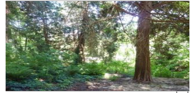
1987 PROVINCE RD

$17,900.00 70x120 Property Taxes $242.22 Agency: prr DEER PARK DIV #2 & 7 405302-531242 BLK: 4 LOT: 8