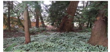
339 MILL RD

$19,900.00 irreg Property Taxes $319.84 Agency: prr Soils Not Done DEER PARK DIV #4 BLK: 4 LOT: 3